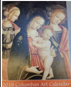
Columban Calendar $12